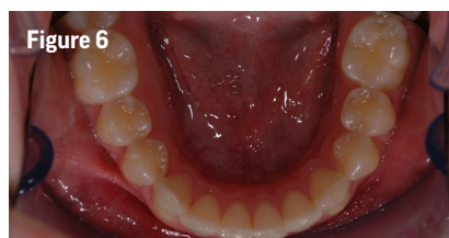
Figures 1-6: Patient LT used 14 upper and 14 lower aligners with minor slenderising (inter-proximal reduction) both in the upper and the lower arch (figures 1-3 before; figures 4-6 after)

Invisible orthodontic techniques, such as clear aligners and lingual appliances, have radically changed orthodontics, allowing patients with particular professional and social needs to undertake treatment.